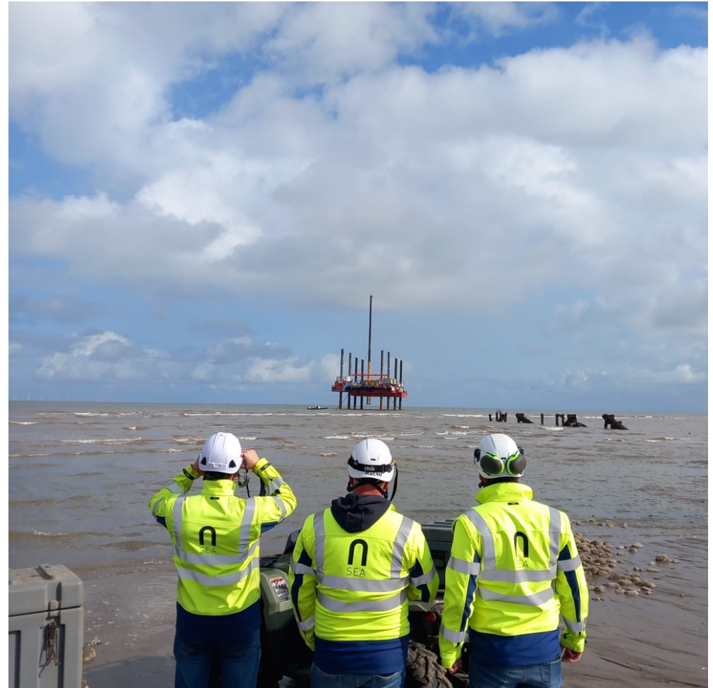
D Support vessel operating on site E Onshore cable crossings F Cable transportation from the Netherlands with a coaster