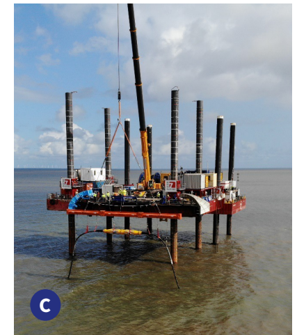
A Two jack-up barges on site executing a float-in B Jack-up barges on site C Subsea Joint Overboarding