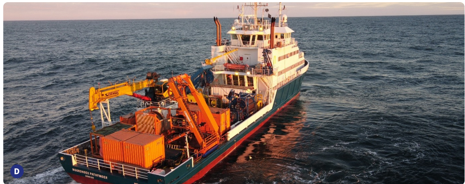
A Deployment of ROV Grab B LARS including grab system C Boulder located on the seabed D Noordhoek Pathfinder with UTROV installed on the aft